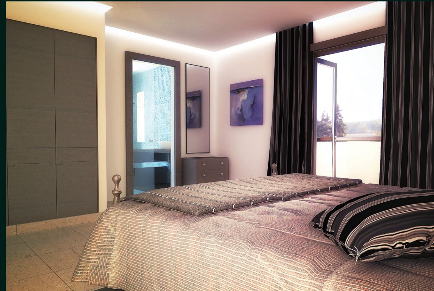
Bougainville Apartment, double bedroom